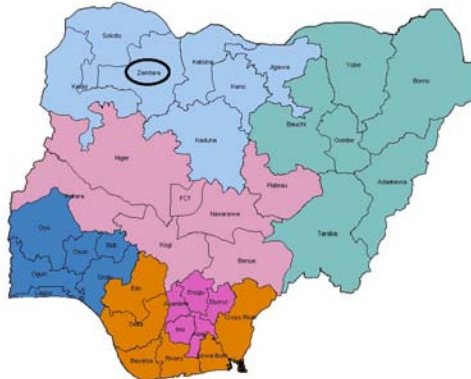
Map of Nigeria and Zamfara State