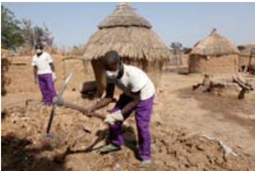
Lead-contaminated dirt is removed from a family compound in Sunke village.

Additional remediation activities will be required to address contamination in the other villages, as well as contaminated water. Source control, best practices for artisanal mining and facilities to support responsible mining need to be developed. In addition, follow up investigations to assess effectiveness of applied measures and remediation should be conducted.