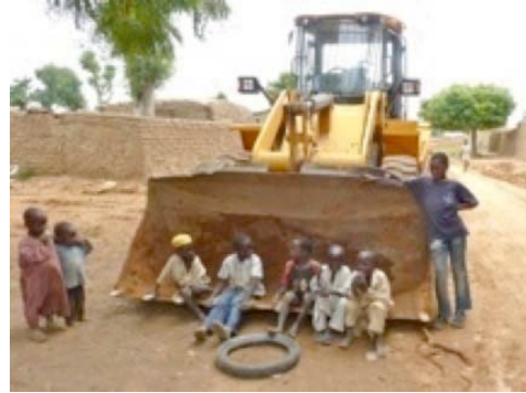
Children gather in a newly remediated area