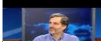
Bacterial Hydrogen Fuel Cells