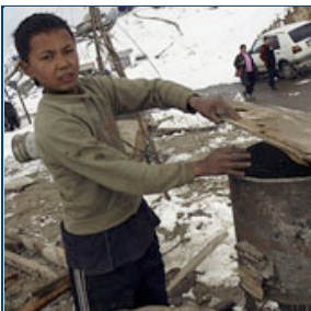
In Pictures: World's Dirtiest Cities

The world has to face the fact that dirt costs, and dirty cities cost big time. Today over half the world lives in urban as opposed to rural environments. This means ever more concentrated dirt.