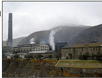
The smelter is important for Peru's metal export industry.

"My 12-year old daughter's hands are swollen with blisters. She tells me her head really hurts, just too much," she said.